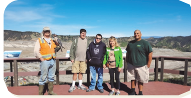
Students from Tierra del Sol

SunshineCanyonLandfill.com or call 800.926-0607