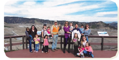
Playgroup from San Fernando