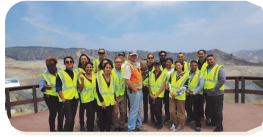
City of Los Angeles Zero Waste Trainees

SunshineCanyonLandfill.com or call 800.926-0607