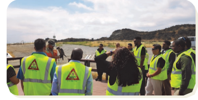
Republic Services Zero Waste Trainees